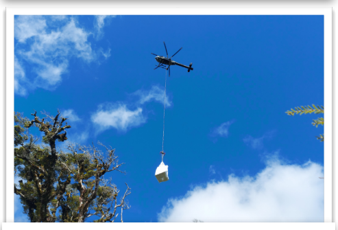
A bluebird autumn day for the helicopter deployment.