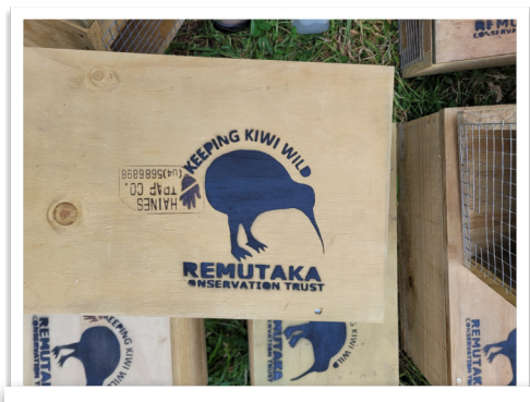
The expertly-made new traps.