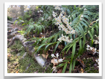
With its low growing nature and small white flowers you will often smell its beautiful vanilla type scent before you spot it. It is endemic to New Zealand and flowers around Easter-time (hence the name!)

Trapper Rebecca Nawalowalo captured this beautiful picture of the Easter Orchid/Raupeka.